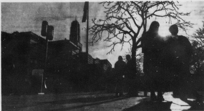
Members of The Church of Jesus Christ of Latter-day Saints await the morning session of General Conference on April 1, 2023.

When you experienced those things, how did you feel? Did you desperately want to make the organization successful but wonder whether your contributions were truly valued? Did you question whether to maintain your level of involvement and engagement? This is, unfortunately, how many women feel within the church.